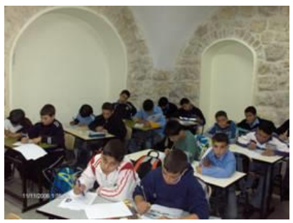
Students attending proficiency test