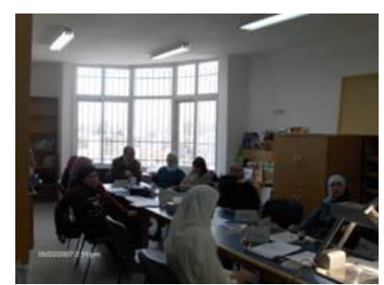
Management course for administrative staff members