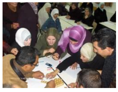
Evening activity for parents – Jabal Al-Mokaber School

Parents were also involved in their children's development processes, as there were a number of evenings dedicated especially for the parents to track their children's improvements in specific areas. Parent participation was remarkable, especially during the children's creative and technological developments.